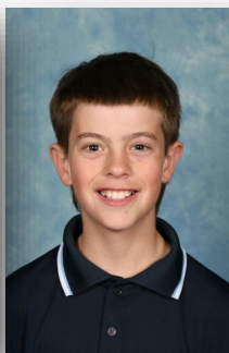
Cam Brindle Minister for Communications