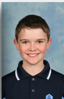
Finnian Scott Minister for Environment