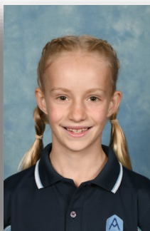
Demi Fairhead Minister for Resources