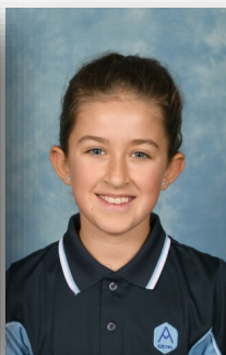
Lily Van Dongen Minister for Sports