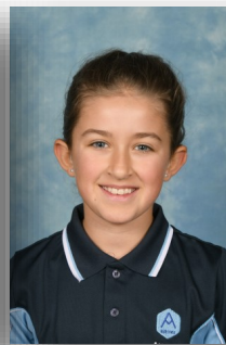
Lily Van Dongen Minister for Sports