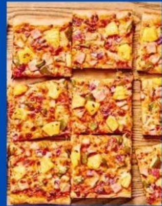
WEDNESDAY PIZZA DAY $5.00

FULL DESCRIPTION OF ITEMS IN THE SPRIGGY APP