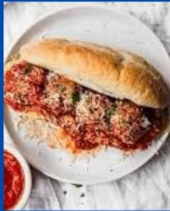
MEATBALL SUB WITH CHEESE REGULAR $6.00 MINI $3.50