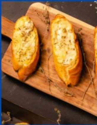
GARLIC BREAD X2 $1.00